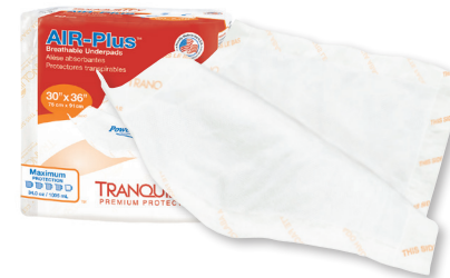
Tranquility AIR-Plus™ Breathable Underpad Maximum Protection