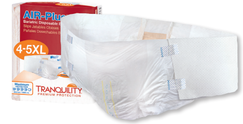
Tranquility AIR-Plus™ Bariatric Tape-tab Disposable Brief Maximum Protection