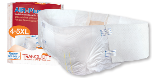
Tranquility AIR-Plus™ Bariatric Tape-tab Disposable Brief Maximum Protection